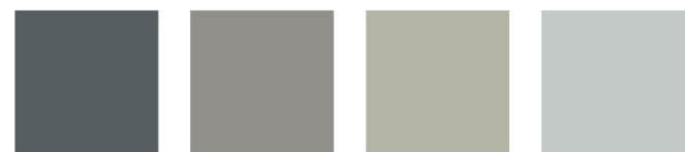
RAL 7012 Basalt grey RAL 7030 Stone grey RAL 7032 Pebble grey RAL 7035 Light grey